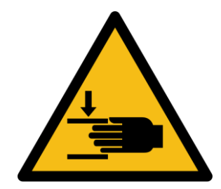
Close the drawers with caution.