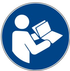
Refer to Instruction manual.

The manufacturer reserves the right to introduce changes to the design of devices, deemed necessary by the manufacturer to improve them.