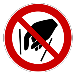
Do not put hands inside.